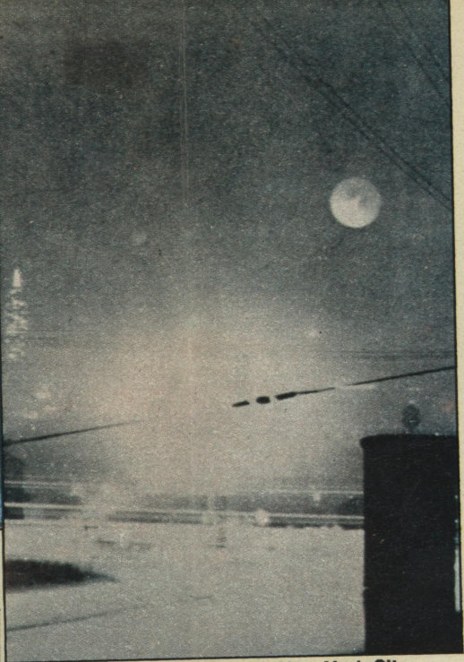
Strange object seen over New York City at 11pm on 28 July 1952