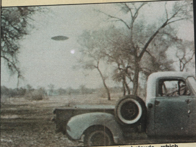
Left, UFOs or lenticular (shaped like a lens) clouds – which look like UFOs – seen in Taormina, Sicily, in 1954. Above, possible UFO seen in Albuquerque, New Mexico, on 18 April 1965