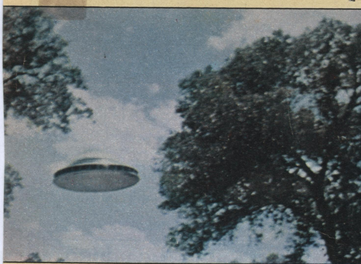
Above, possible UFO seen in Peralta, New Mexico, on 16 June 1963