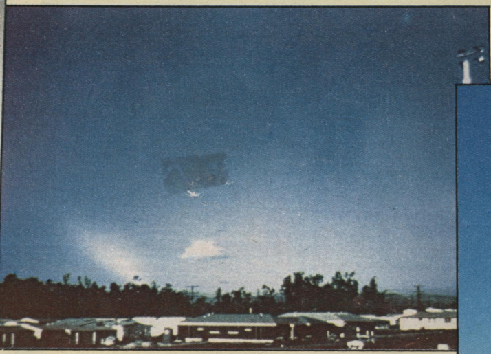
Left, seen in Escondido, California at 10am on 10 July 1956 was this object: 60m in diameter, 13m in height, hovering at about 300m. Above, cloud seen in Phoenix, Arizona, in 1957. Right, UFO-like cloud from 'Mysterious World' book